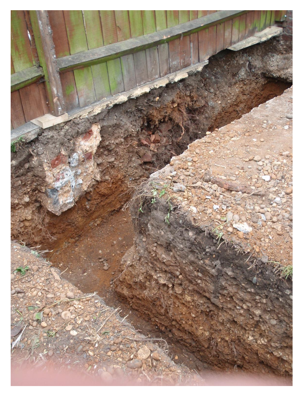
Plate 2. Showing previous modern impacts