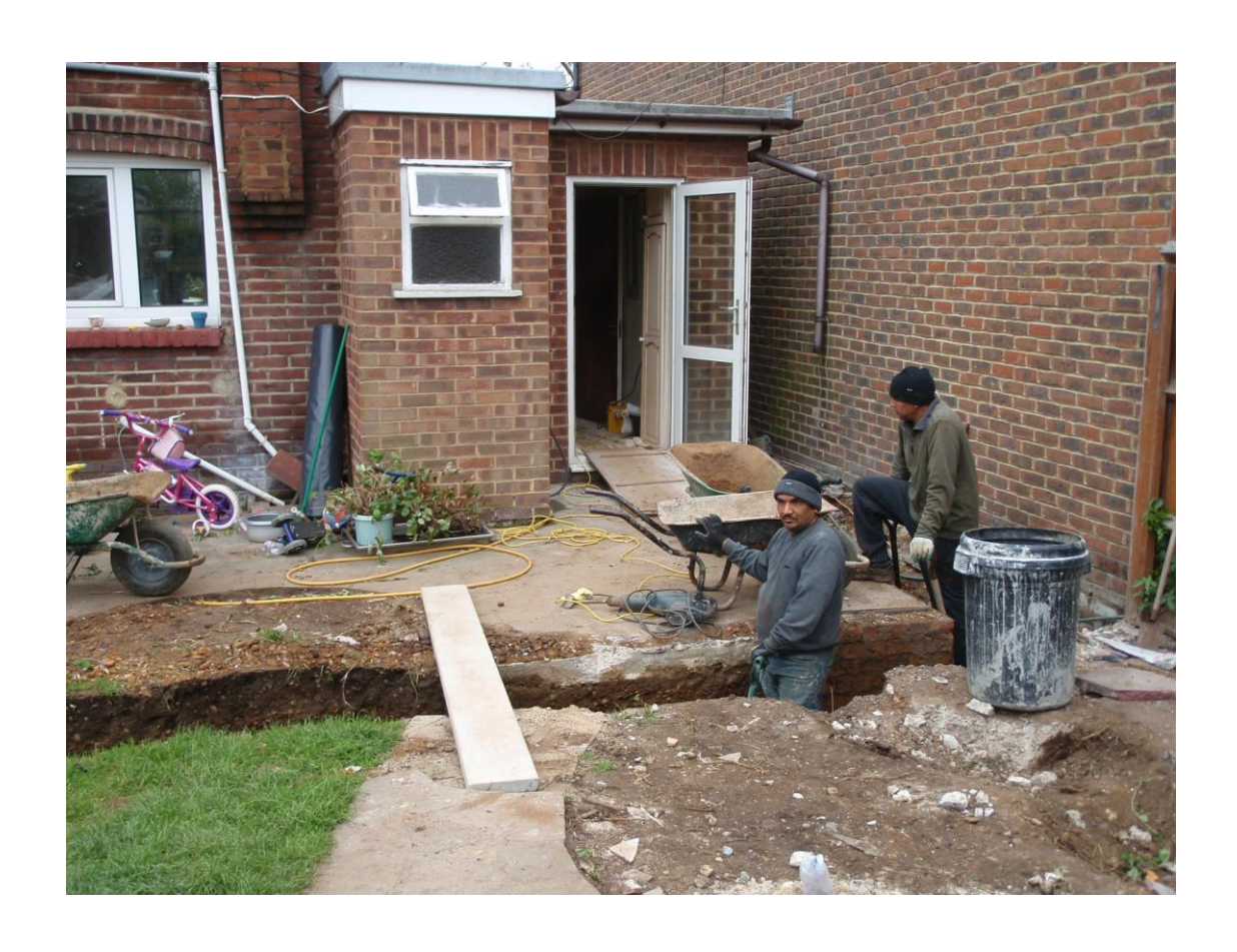
Plate 1. Showing topographic setting of site