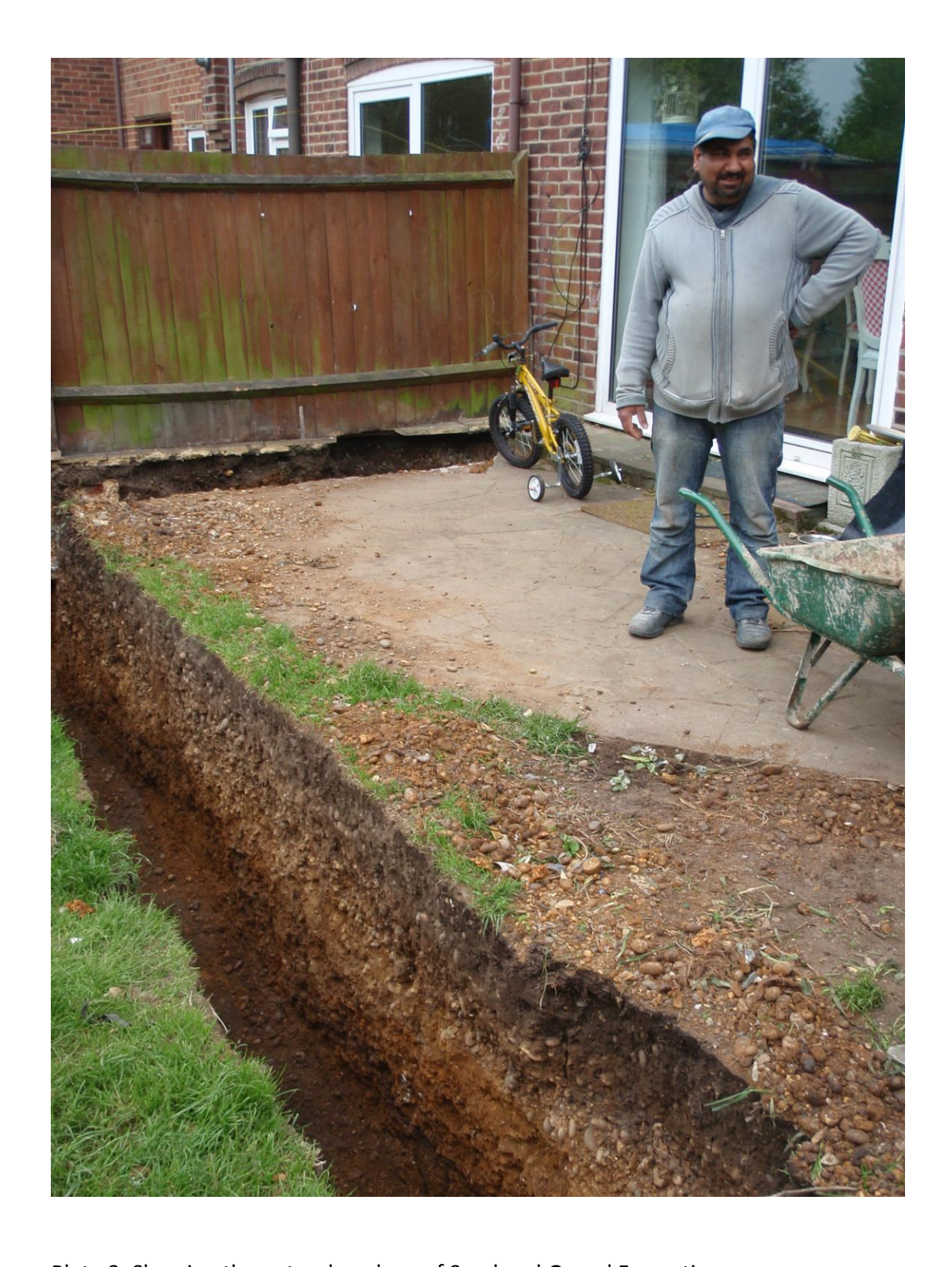
Plate 3. Showing the natural geology of Sand and Gravel Formation